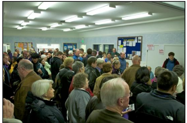
Crowd in Parish Hall at intermission waiting for the Prize Drawing